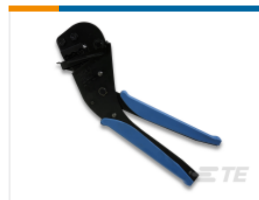
TE Part # 1SET191002R0000 TET CRIMP-HT