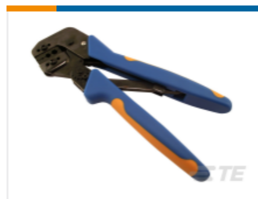
TE Part # 1SET191001R0000 CRIMP-HT