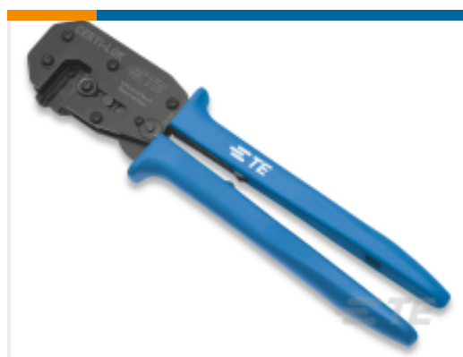
TE Part # 169400 CERTI-LOK FRAME W/O DIES