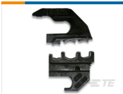
TE Part # 169404 CERTI-LOK DIE